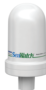
Kit Includes: 3004 panel TV Antenna, 20' RG-59 coax cable, F-connectors, USB, AC/DC power cords

The 3004 antenna is designed for the mobile lifestyle and can be used on marine vessels, RVs, pop-up campers and more! Watch your favorite sports, sitcoms, reality TV, crime dramas, local news, weather, kids programming and more for FREE and in 1080 HD!